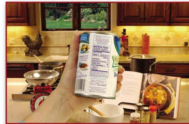
ACRYSoF® ReSTOR® IOL provides a full range of vision, decreasing the dependency on reading glasses or bifocals.

In the clinical study, 80% of patients receiving the ACRYSoF® ReSTOR® IOL reported that they never wear glasses for any activity. With the ACRYSoF® ReSTOR® IOL they can read a book, work on a computer, and drive a car - day or night - and play golf or tennis with increased freedom from glasses. In fact, patients were so pleased with their vision, nearly 94% of them said, if given the choice, would have the ACRYSoF® ReSTOR® IOL implanted again.