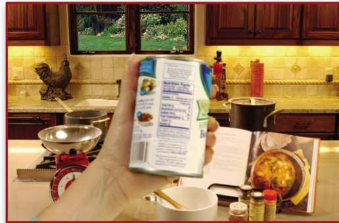
Until recently, most patients had their vision improved with a monofocal IOL. Although the quality of their distance vision was excellent, most patients needed reading glasses to see near objects.

For most cataract patients, life without reading glasses or bifocals is something they either experienced before presbyopia or have just dreamed about for most of their lives. But today, the ACRYSoF® ReSTOR® IOL is turning those dreams into reality with its revolutionary lens technology, which is designed to allow patients to see clearly at all distances without bifocals or reading glasses. The ACRYSoF® ReSTOR® IOL is now available and delivers a high level of spectacle-independent vision for cataract patients.